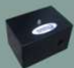
Bump Integrators - Roughness (e.g. IRI)