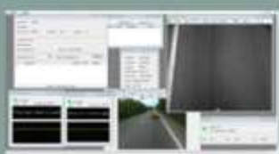
ROMDAS Data Acquisition In Vehicle